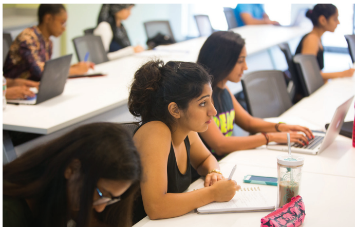
Students in the program

The Graduate Program in Food and Business Economics resides in the Department of Agricultural, Food and Resource Economics (DAFRE) in the School of Environmental and Biological Sciences (SEBS). The objective of the program is to develop the ability of students to apply economic theory and high levels of quantitative and analytical skills to significant problems facing society in the areas of: economics of biotech/ pharmaceutical sectors, production and marketing of agricultural and food products, land/environmental policy and management, and international development, among others.